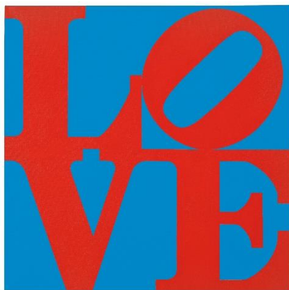
ROBERT INDIANA (1928-2018) LOVE

Christie's Contemporary Edition auction on Wednesday, 4 March achieved the highest ever sale total for Contemporary Edition sales, with a combined total of $2,385,750. The top lot of morning session was Jasper Johns , Figure 5, from Color Numeral Series , which achieved $43,750. The top lot of the afternoon session and sale was Andy Warhol , $ (1): one plate , which realized $87,500. Other exceptional prices were achieved for David Hockney , Sun State I which realized $68,750 and Richard Diebenkorn , Touched Red which achieved $50,000.